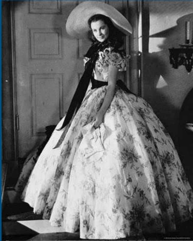
("The Role of Women in the Civil War")